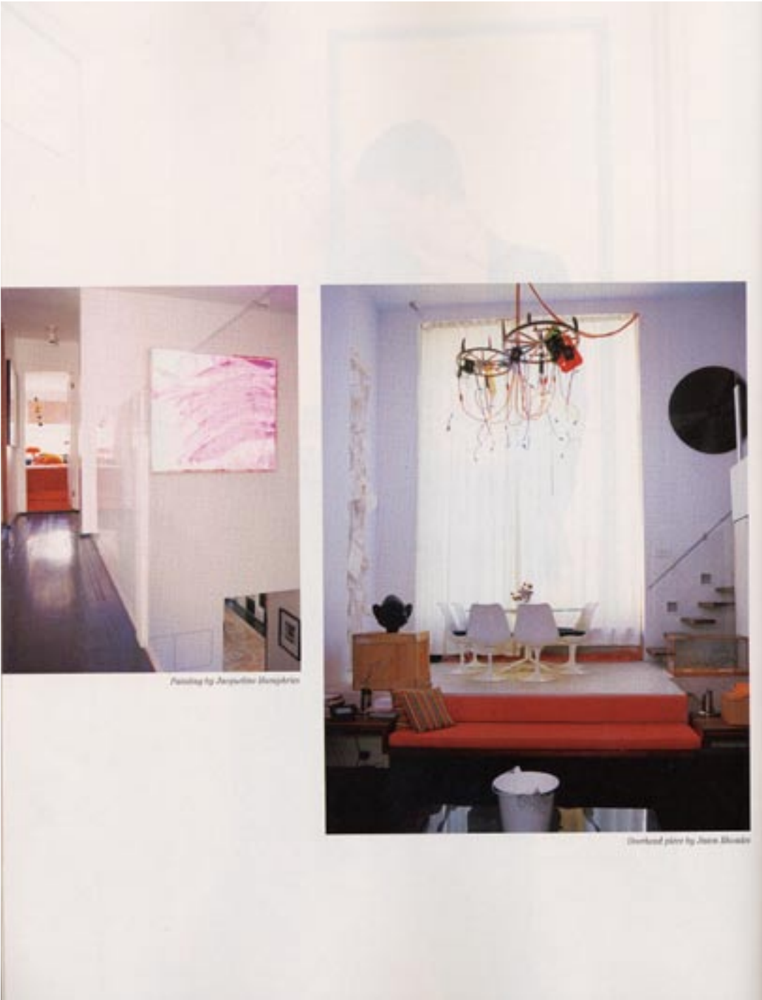
Painting by Jasper Johns